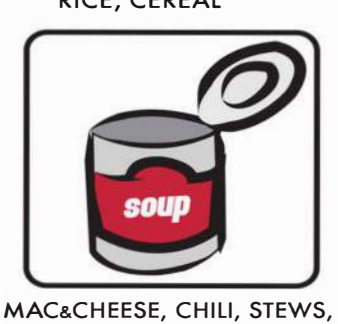
MAC&CHEESE, CHILI, STEWS, MEATY SOUPS