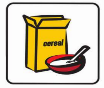
PASTA, POTATOES, RICE, CEREAL