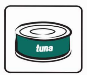
TUNA, SALMON, SPAM, CHICKEN, HAM