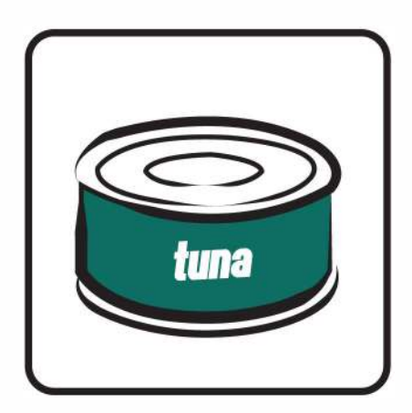
TUNA, SALMON, SPAM, CHICKEN, HAM