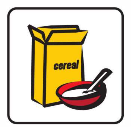
PASTA, POTATOES, RICE, CEREAL