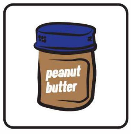
PLASTIC JARS ONLY