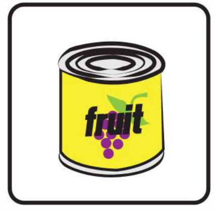
ALL SIZES, ALL KINDS