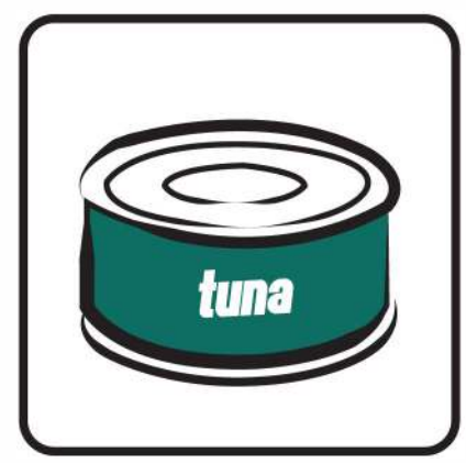
TUNA, SALMON, SPAM, CHICKEN, HAM