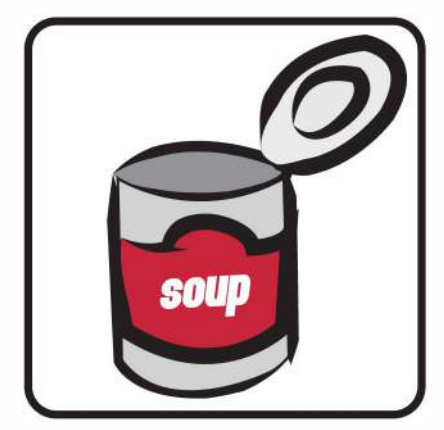
MAC&CHEESE, CHILI, STEWS, MEATY SOUPS