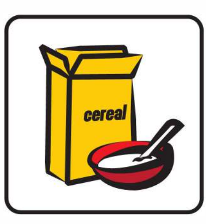
PASTA, POTATOES, RICE, CEREAL