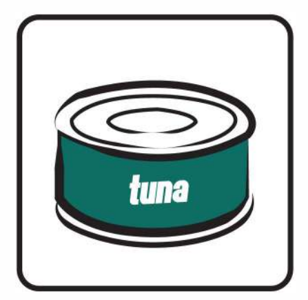
TUNA, SALMON, SPAM, CHICKEN, HAM