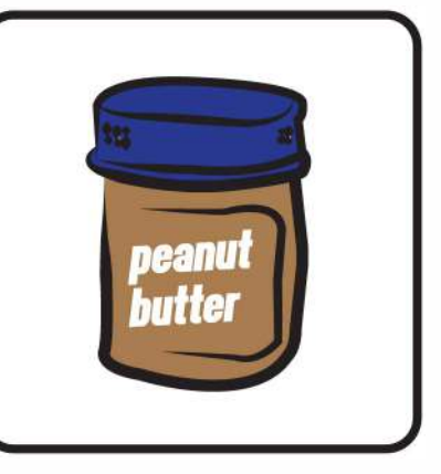
PLASTIC JARS ONLY