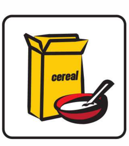
PASTA, POTATOES, RICE, CEREAL