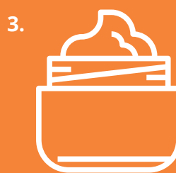
1 BABY CREAM