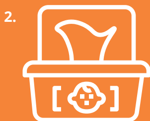
1 PACK OF BABY WIPES