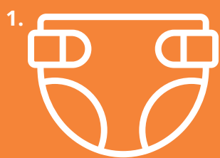
1 PACK OF DIAPERS*