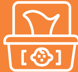
PACKS OF BABY WIPES