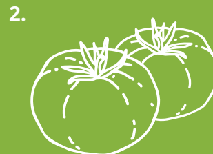
1 BOTTLE OF KETCHUP