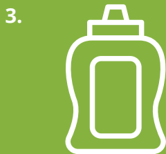
1 BOTTLE OF MUSTARD