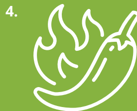
1 BOTTLE OF HOT SAUCE