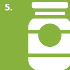
1 BOTTLE OF MAYONNAISE