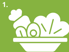
1 BOTTLE OF SALAD DRESSING

*Important Note: NO GLASS. All items must be shelf-stable, new and in original packaging and must contain nutrition facts.