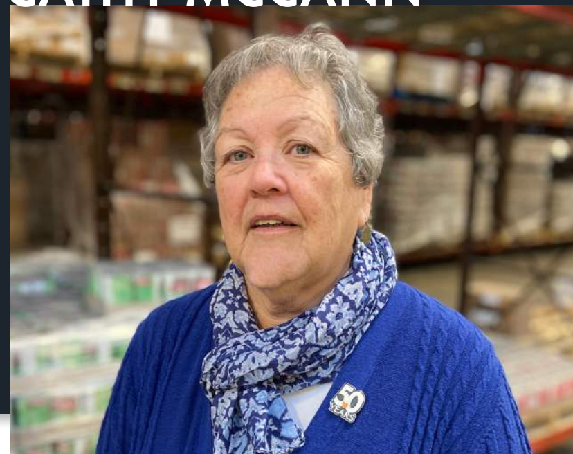
RETIRED CFBNJ VICE PRESIDENT OF OPERATIONS