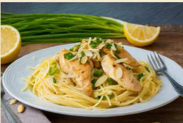
Lemon Chicken Pasta