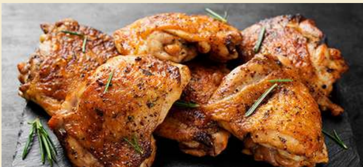
Tangerine Garlic Chicken