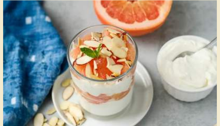
Grapefruit Yogurt Parfait