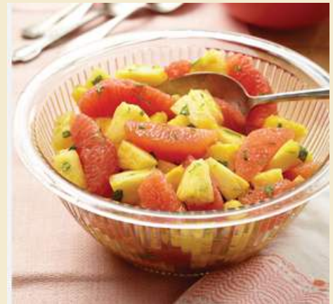
Sunny Citrus Salad