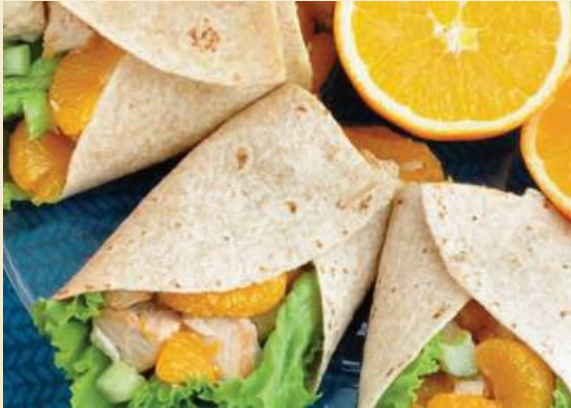
Sunshine Roll Ups